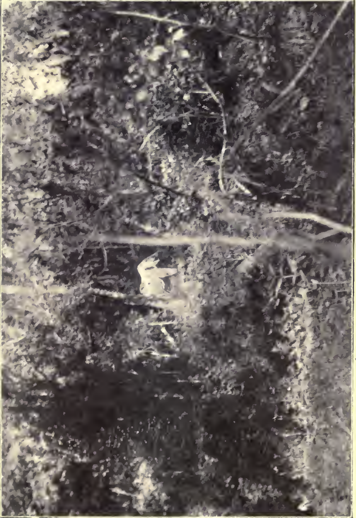
" WE SAW ANOTHER ELEPHANT, "